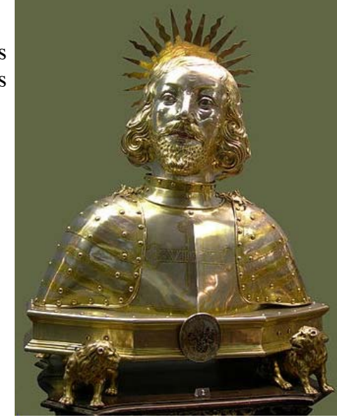
Reliquary of St. Victor