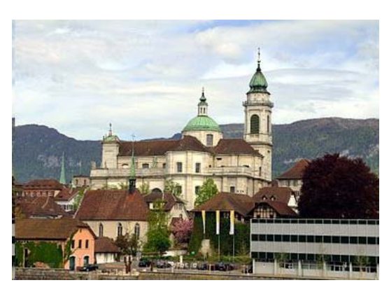
Cathedral of St. Ursus and Victor

2. On this day also St. Ursus and St. Victor and 66 soldiers belonging to the Theban Legion were martyred in the Swiss city of Solothurn.